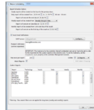
LiveNX Report Scheduler

LiveNX’ s report scheduler ensures timely reports are distributed to custom lists at your convenience. Schedule reports such as daily health check request, Bandwidth, CPU and memory utilization to inform the organization of the current status of applications and network performance.