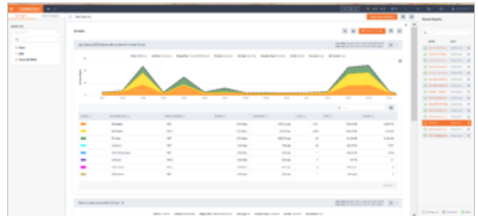
LiveNX – Device Inventory Story

LiveNX reports on the application performance across each domain as the data traverses; VPNs, Tunnels and Service Provider services, between sites, and for each device and interface to report on each element contributing to the end-to-end user experience.